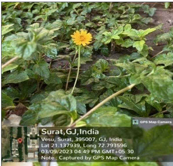
Fig 1: Sample plant ( Wedelia urticifolia )

Plant sample was collected at flowering stage from Vesu, Surat, Gujarat (Lat 21.137939, Long 72.793596). The healthy plant used for the present study and was collected in bag and managed at Bhagwan Mahavir College of Science and Technology, Surat, Gujarat. The plant materials were brought to laboratory and were washed carefully under tap water to remove any adhering dirt and debris.